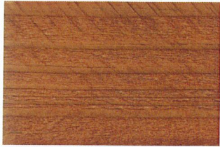
Sienna - 04