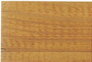
Tawny Cypress - 11