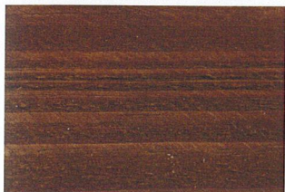
Chestnut - 13