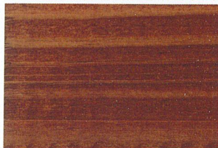
Teak - 12