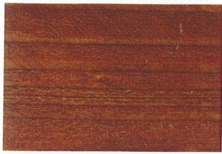
Mahogany - 02