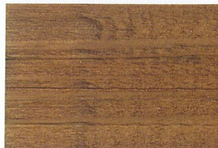
Walnut - 14

Colors displayed were applied to pressure treated lumber and approximate the actual color. The actual color and opacity will vary depending on the color selected, wood type and porosity of the substrate. Always apply a test sample to the surface being stained to ensure the color selected is the desired finished appearance.