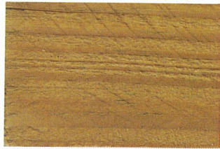
Classic PT - 03