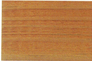
Online Website Natural - 06