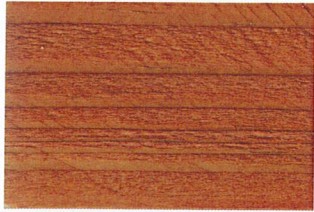
Redwood - 08