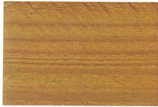
Online Website Cedar - 09